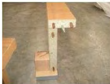
2. Fit cam bolts to foot end