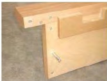
1. Fit cam bolts to side rails,