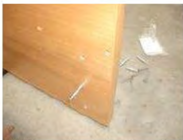
4. Fit cam bolts to head end