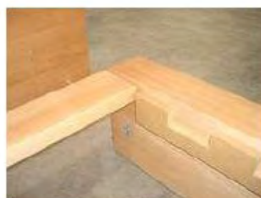
6. Attach head rail to side rails and tighten cam under top of side rail

Then attach head panel to side rail and small head rail