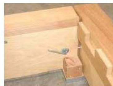
5. Connect foot end to side rails and tighten cams

- 1 inside foot end & one underneath top of side rail