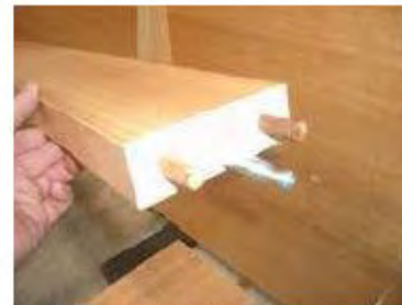
3. Fit cam bolts to head rail